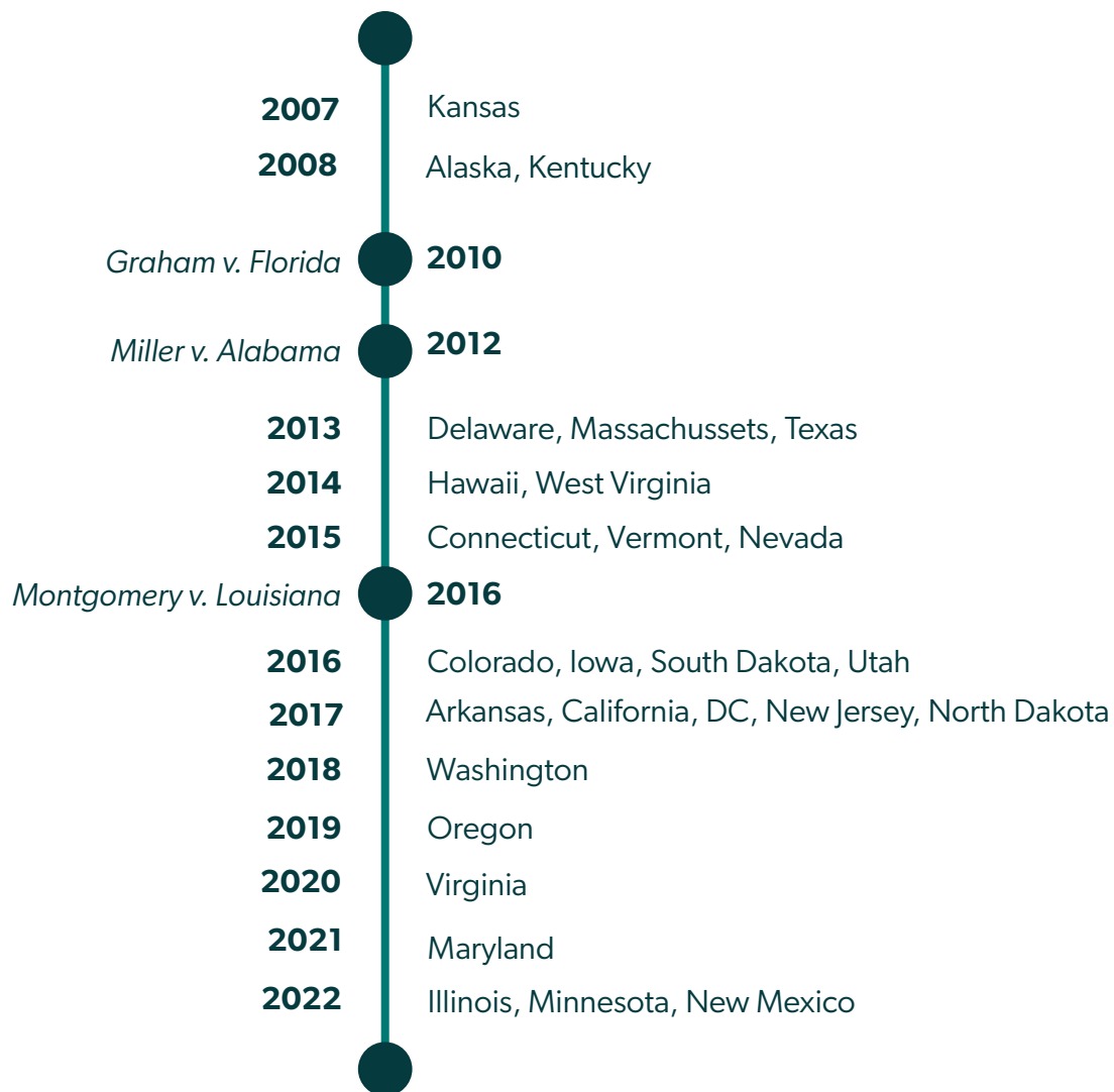
Figure 1. Chronology of State JLWOP Bans

The Supreme Court's rulings propelled a growing number of states to ban JLWOP sentences altogether, reflecting a significant shift in precedent and interpretation of the Eighth Amendment's protection against cruel and unusual punishments. 13 As depicted in Figure 1, only three states had excluded individuals under 18 from receiving parole-ineligible life sentences when Miller was decided: Alaska, Kansas, and Kentucky. After the Miller ruling, an additional nine states banned JLWOP: Connecticut, Delaware, Hawaii, Massachusetts, Nevada, Texas, Vermont, West Virginia, and Wyoming. After the court's Montgomery v. Louisiana ruling in 2016, an additional 16 states and the District of Columbia banned JLWOP. 14 This brought the total of states that ban LWOP for juveniles to